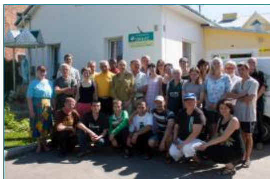
Companions and employees in front of the community

Street outreach work - every winter, Oselya cares for the homeless by distributing meals.