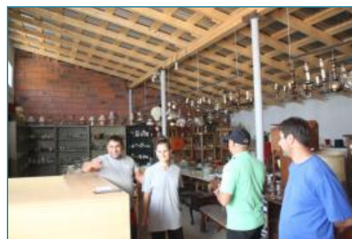
Shop, September 2012