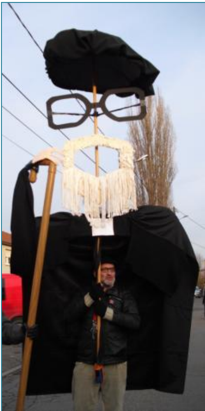
Emmaus Forbach's 30th anniversary

EMMAÜS EUROPE EMMAÛS EUROPE EMAUŠ EUROPA