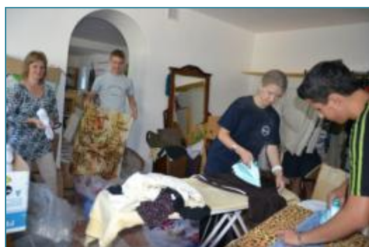
Clothes ironing area